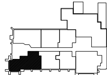
○ FIRST FLOOR: 980 SQ.FT. - KEY PLAN